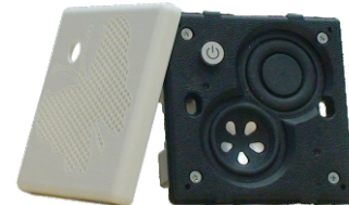
SW8611-0 with butterfly panel